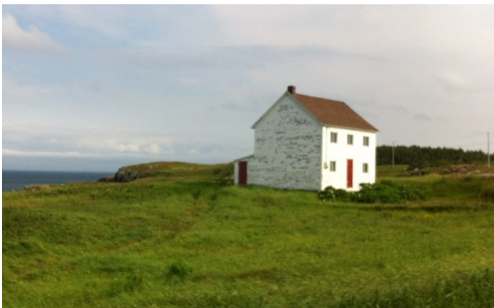
Figure 6. A historic saltbox home in Maberly. Residents of the Bonavista region have a strong sense of place rooted in built heritage and other community assets.

Overall, the gap analysis revealed that much of the public data used in the Report Card are not currently at a good quality for measuring current well-being in the Bonavista region. This is due to the fact that Census data from 2011, the most recent year with full data released, often do not have data available for Local Areas, which are the only geographic level that include both municipalities and residents living in LSDs or unincorporated areas. Thus, many of the indicators can only be measured using data that are over 10 years old, which do not accurately reflect current conditions. However, other indicators do have 2011 Census data or are based on the survey conducted as part of the prior research in the region in 2015. Data quality will improve soon as the 2016 Census results are released. However, we recommend that additional public input is needed to identify how these and other data can measure the unique assets that contribute to the well-being of the Bonavista region. This input would ensure that a future sustainability assessment finds locally appropriate ways to assess vital regional assets, like the sense of place that residents feel to their communities or the role of the arts in sustaining the region. This effort, by determining what data are currently available at the regional level, can inform future attempts to identify and monitor regional well-being assets.