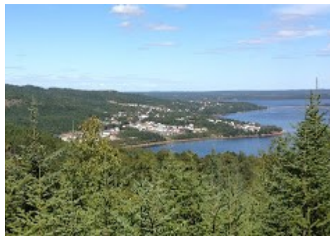
Figure 2. Clarenville seen from Bare Mountain.

and respond to the interests and concerns of community members at every point possible, which led the project to focus on further regional engagement efforts within the region. This project led to several outcomes, including the Report Card document itself, proposed revisions to the indicators for future use in the Bonavista region, and a directory of regional organizations. The project also fostered dialogue about how best to monitor and enhance