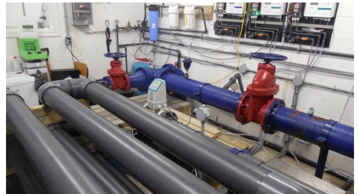
Figure 5. The Good News Stories in the Report Card allowed us to learn about promising initiatives like Sunnyside's water treatment pilot.

team about the distinctness of each of the three regions involved in the project. During public consultations, community members stressed that the boundaries of the Rural Secretariat region did not accurately reflect the economic and socio-cultural realities of the regions with which they identified. Although our partnership with Regional Council led to using the Rural Secretariat region as the scope for the Report Card, we felt that any future exploration of regional governance should focus on each of the three regions individually.