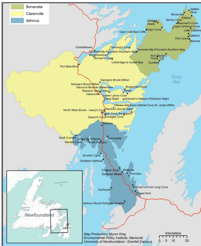
Figure 3. Map of the three regions involved in the project: Bonavista, Clarenville, and Isthmus of Avalon regions. Credit: Myron King, Environmental Policy Institute, Grenfell Campus of Memorial University.

Rural regions across NL are facing threats to their long-term sustainability. Issues such as out-migration, volatile markets, and changes in fisheries pose great challenges to small communities that often have limited capacity to adapt to these issues. 1 Many communities have begun to explore collaborative regional approaches to rural governance such as service-sharing agreements, joint councils, and regionally-based economic development. However, regional collaboration requires support from government agencies, which has been gradually withdrawn from rural NL. From the phasing out of the Rural Development Associations (RDAs) in the 1990s, to the dismantling of the Regional Economic Development (RED) Boards in 2012, to the elimination of the Rural Secretariat in 2016, institutional support for rural development at the provincial level has all but disappeared. 2 Today, rural regions have few institutional supports within government to enable regional collaboration and support the sustainability of rural NL.